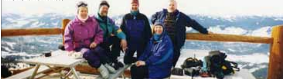
Gelandesprung Ski Club Whistler/Blackcomb 1995

clubs are working on the final details for the weekend trips and hopefully by the next newsletter, this will all be taken care of. So, like I said, the summer is not even over and it is time to start planning for the next ski season.